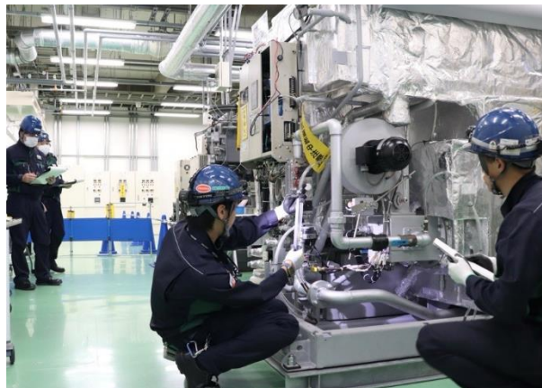
The competition (from top left: elevator and escalator maintenance division and legal inspection division; from bottom left: installation division and air conditioning maintenance division)

Tokyo, November 21, 2024 – Hitachi Building Systems Co., Ltd (hereinafter Hitachi Building Systems ) today announced that it held the Safety and Skills Competition with Hitachi, Ltd. (hereinafter Hitachi ) from November 18 to 20 at its in-house training facilities in Tokyo. The contestants this time were elevator or air-conditioning equipment engineers who work for Hitachi Group companies in Japan and overseas.